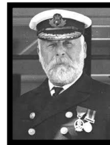
Captain Edward Smith